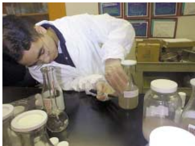
Figure 1. Deionized water is added to the dry sediment sample. A meniscus line is then drawn, showing the top of the water level.

1 The use of brand, trade, or firm names in this report is for identification purposes only and does not constitute endorsement by the U.S. Geological Survey.