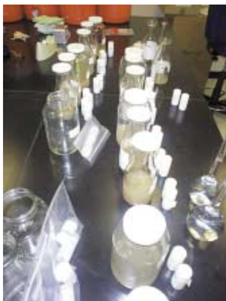
Figure 2. Samples are placed in pint-size and quart-size bottles.